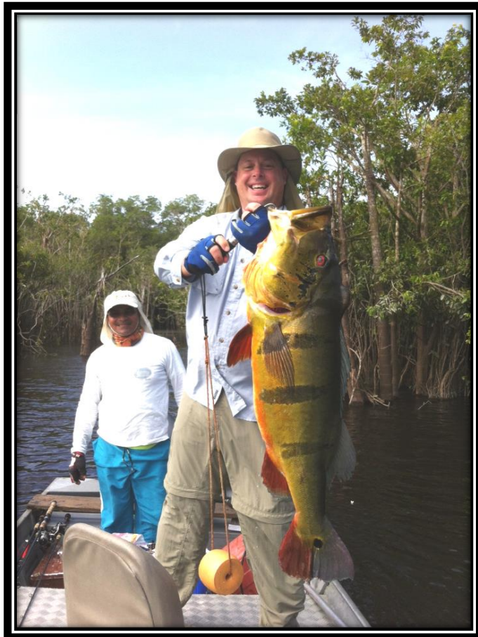
A Record 25# of Fight!

without intrusive interruptions, or hurrying off because you've run out of time. This outfitter has investigated and studied the regions that he'll be taking you to, so his knowledge will help you have an unparalleled experience. Combine that with his specialized tackle packages and you'll have nothing to worry about except catching trophy peacock bass, taking the photo and then releasing the beautiful animal back to the wild